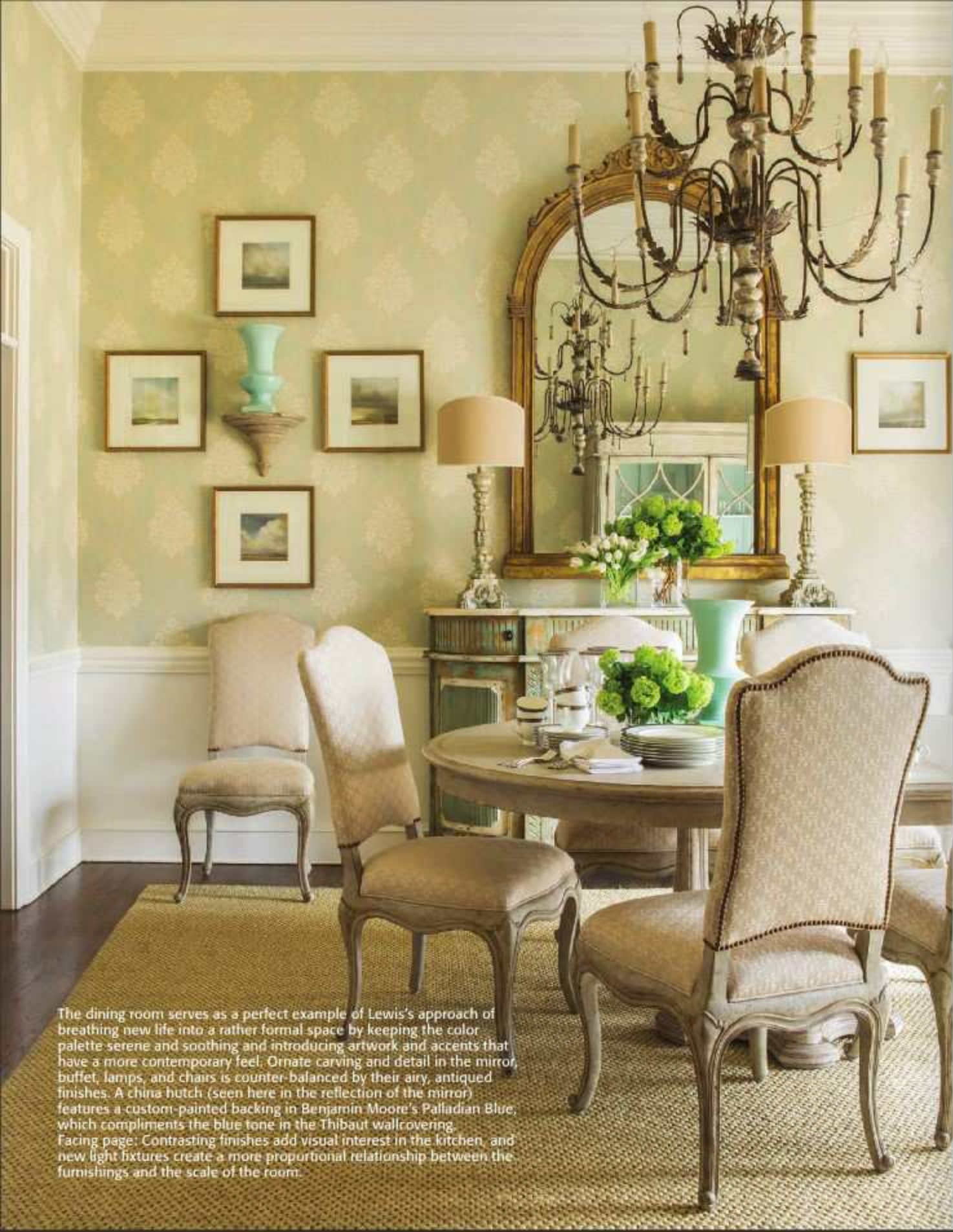
The dining room serves as a perfect example of Lewis's approach of breathing new life into a rather formal space by keeping the color palette serene and soothing and introducing artwork and accents that have a more contemporary feel. Ornate carving and detail in the mirror, buffet, lamps, and chairs is counter-balanced by their airy, antiqued finishes. A china hutch (seen here in the reflection of the mirror) features a custom-painted backing in Benjamin Moore's Palladian Blue, which compliments the blue tone in the Thibaut wallcovering. Facing page: Contrasting finishes add visual interest in the kitchen, and new light fixtures create a more proportional relationship between the furnishings and the scale of the room.