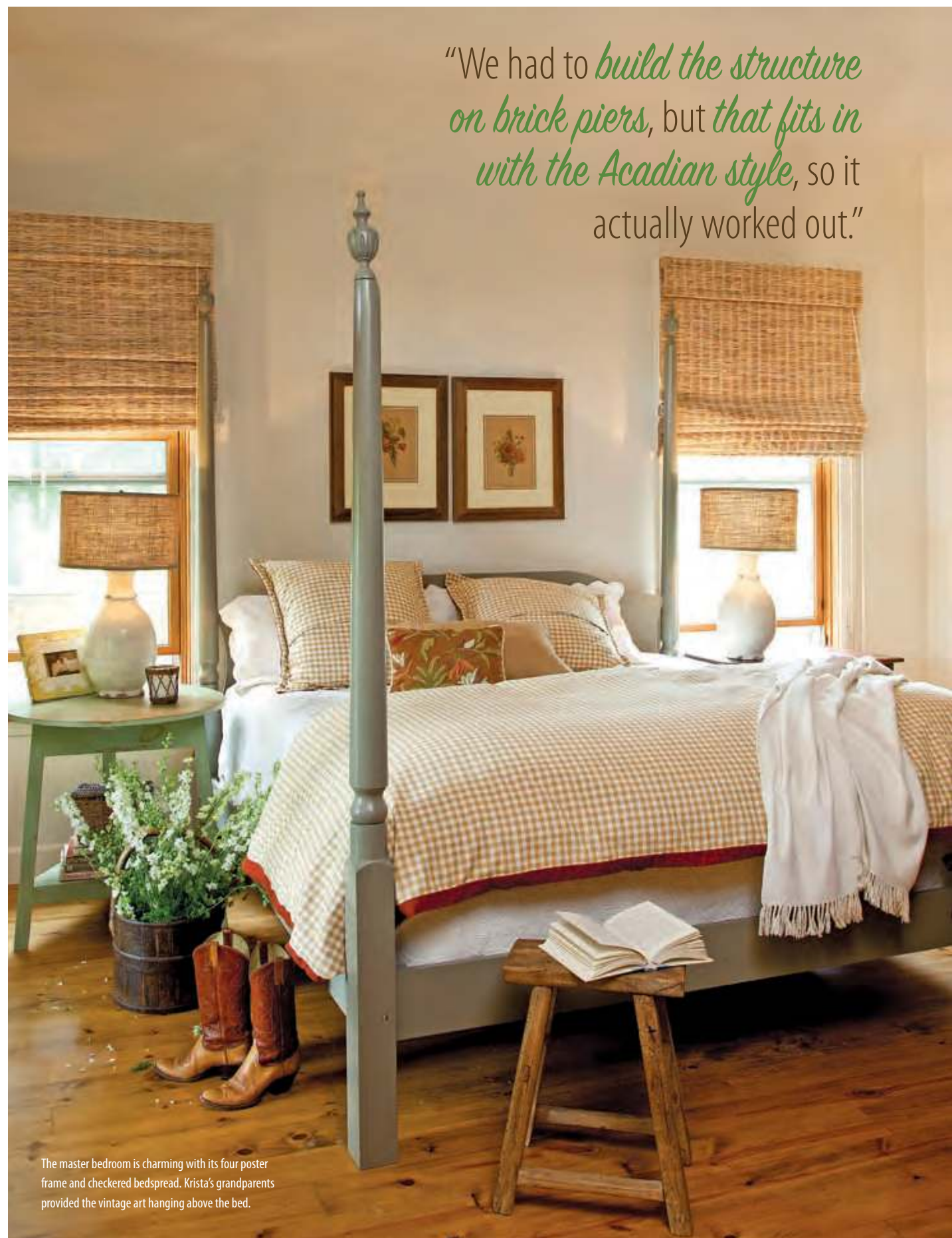
The master bedroom is charming with its four poster frame and checkered bedspread. Krista's grandparents provided the vintage art hanging above the bed.

"We had to build the structure on brick piers , but that fits in with the Acadian style , so it actually worked out."