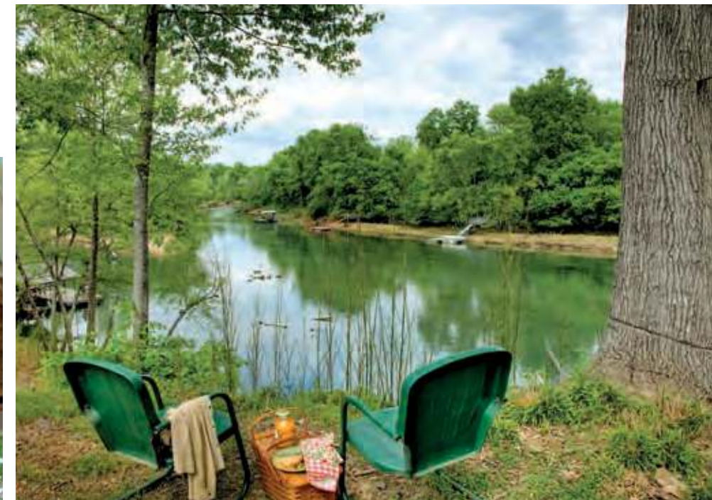
Little Red River provides a tranquil atmosphere right outside the Allmendingers' home. All you need is a few chairs and a picnic basket filled with food for a relaxing afternoon.