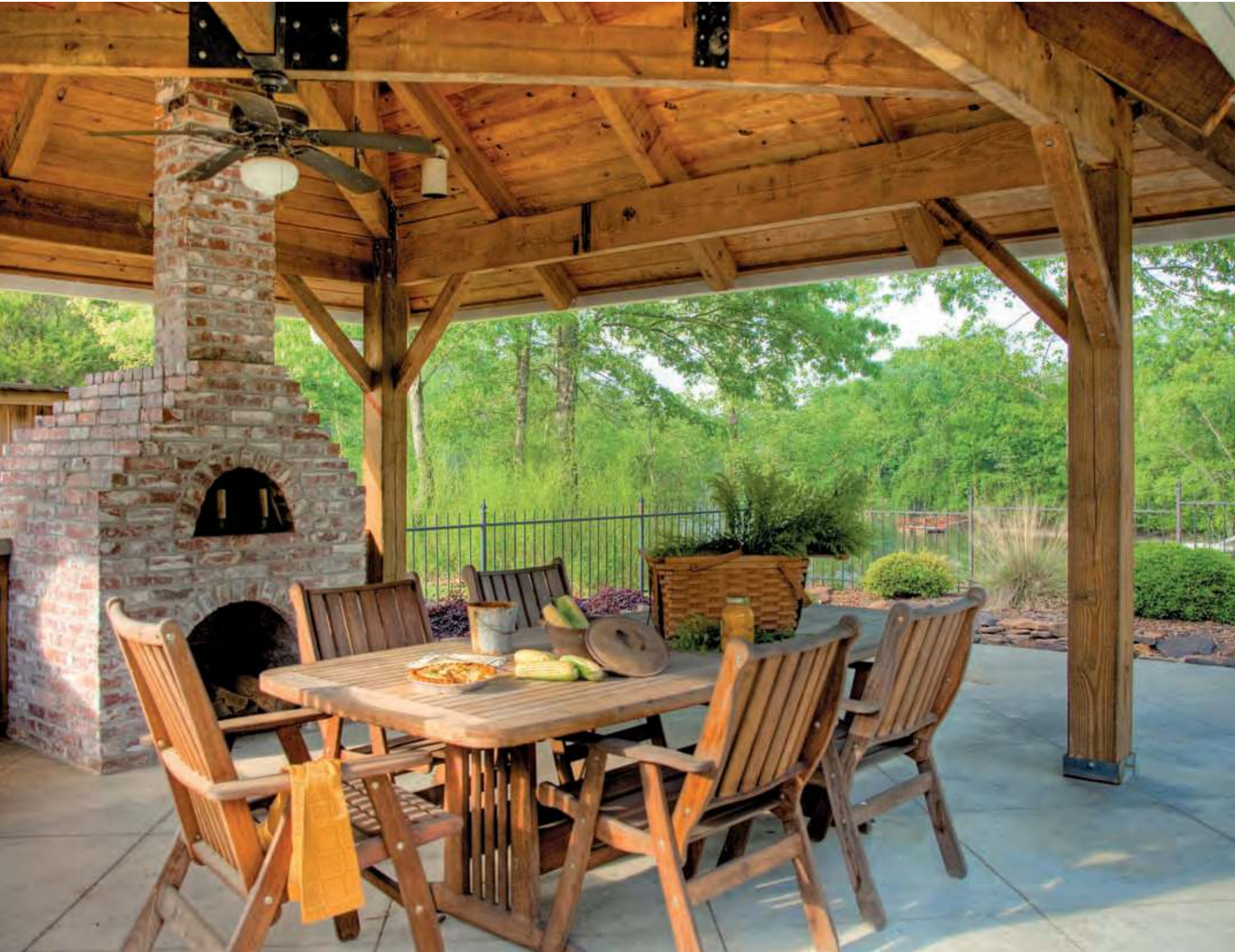
The custom-built patio cover is made of pine and covered with shingles like a mini farmhouse roof. A brick pizza oven takes center stage, as well as a Jarrah wood table and chairs, which is durable for outside use.