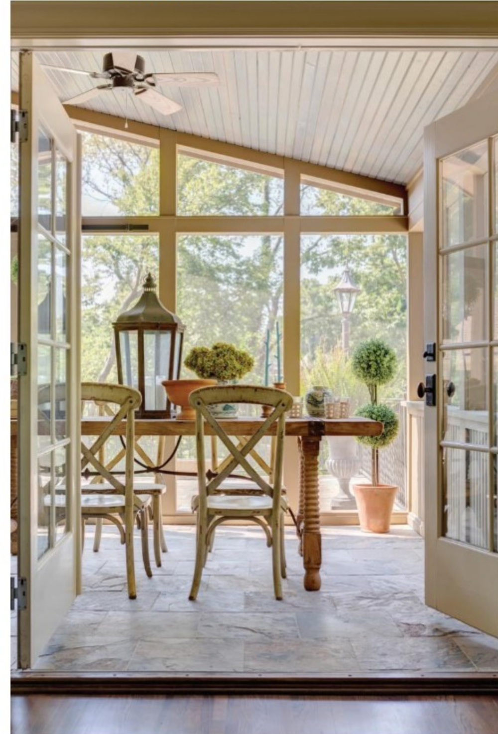
SOUTHERN BREEZE The home's traditional feel continues to the back porch where features such as slate flooring and a wooden paneled ceiling treatment add a timeless warmth. A spindle-leg table and weathered-look X-back chairs create a welcoming space to gather with friends and family.