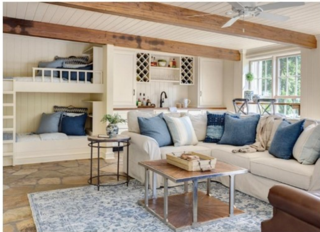
The home's signature blue hue carries into the downstairs den, which serves as a gathering spot (and sleeping space, thanks to built-in bunks) near the pool.