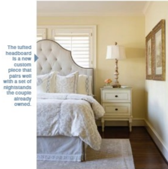
The tufted headboard is a new custom piece that pairs well with a set of nightstands the couple already owned.

SOFT-SPOKEN SUITE All of the bedrooms, including the couple's master suite, are housed on the top floor of the three-story home. In the bedroom, a mix of patterns adds interest while the united neutral palette brings a sense of calm to the room. The couple also redesigned the bath on their own shortly after moving to the home. The clawfoot tub, hardwood floors, and paneling all speak to their love of traditional design.